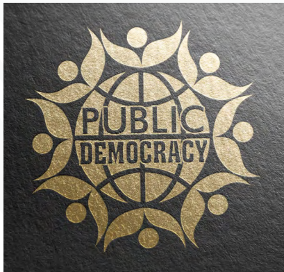
05 THE VALUE