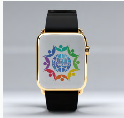
05 THE FUTURE